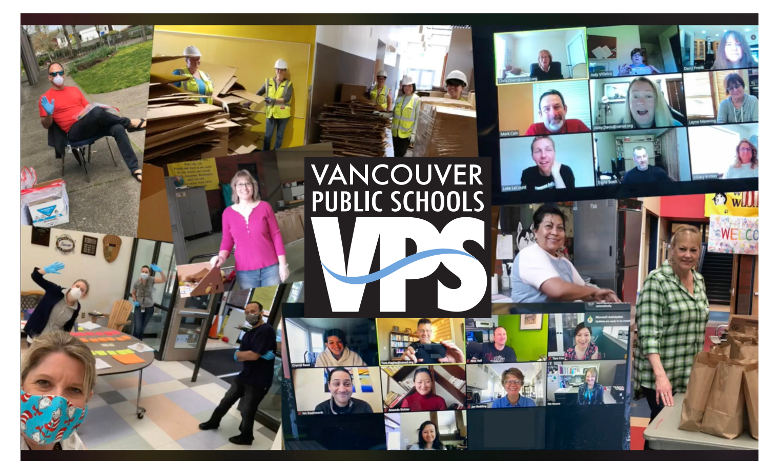
A guide to meeting the challenges of COVID-19